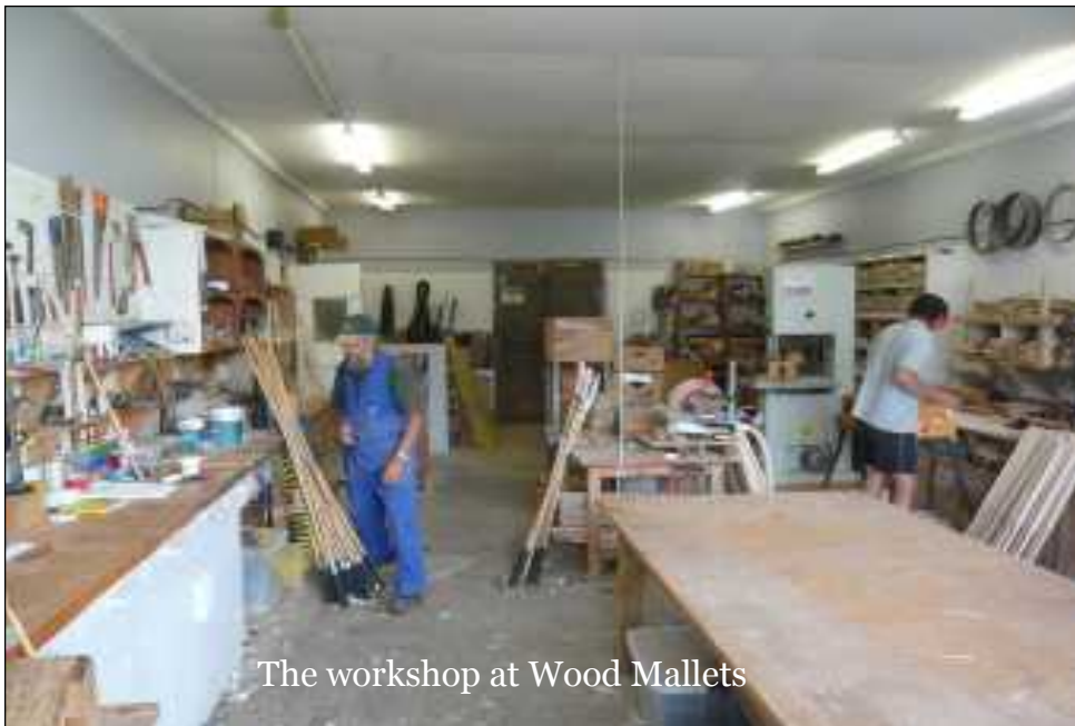
The workshop at Wood Mallets