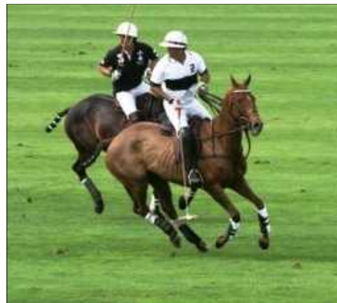
Carlos Gracida using a Fibercane in the Gold Cup UK

Although I understand the reluctance to change over to composite shafts for those who have become accustomed to the inconsistencies of canes, I firmly believe that our latest composite mallets have huge benefits over others. They're incredibly powerful and generally last several times longer than other types of mallets. Despite rough treatment they retain their shape and they never "wring". Perhaps the greatest attraction is the consistency which is not possible with canes. They have an increased sweet spot, minimal vibration and a revolutionary moulded handle for comfort, grip and long life. Just like tennis racquets, fishing rods and golf clubs, polo mallets can also take advantage of modern materials and technology.