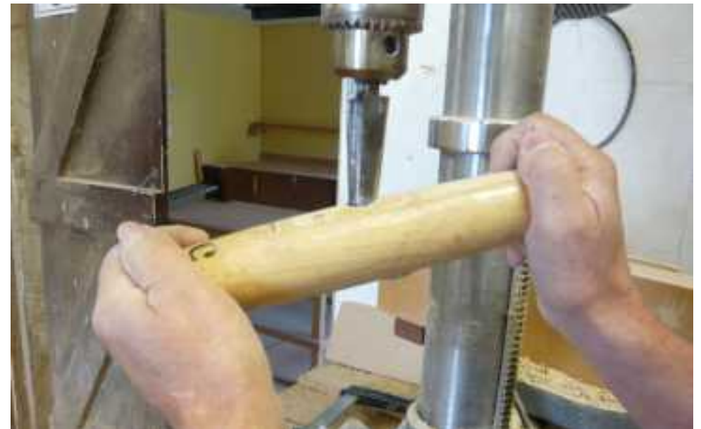
Below: Using a tapered reamer to widen the hole at the top of the head