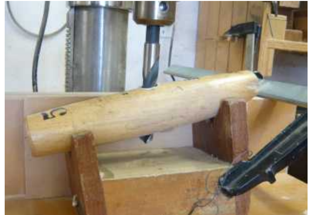
Above: Drilling out a head using a drill press and jig.